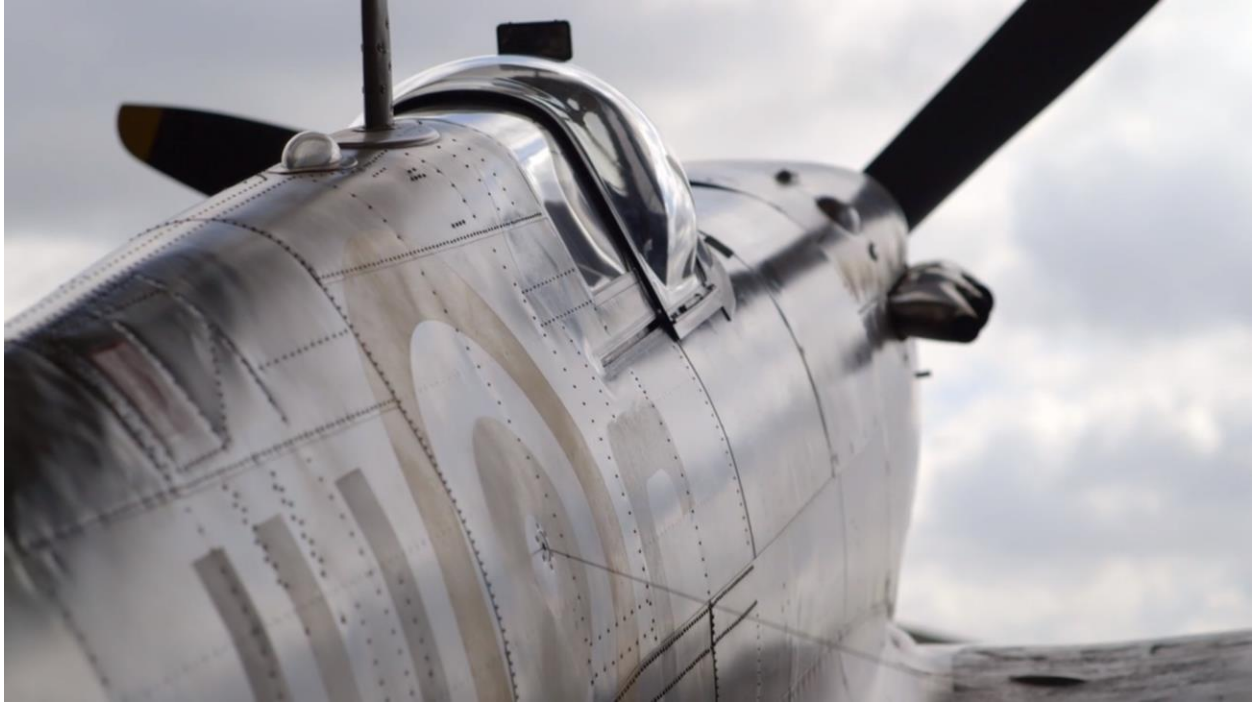
A Spitfire fighter at Duxford Airfield, UK