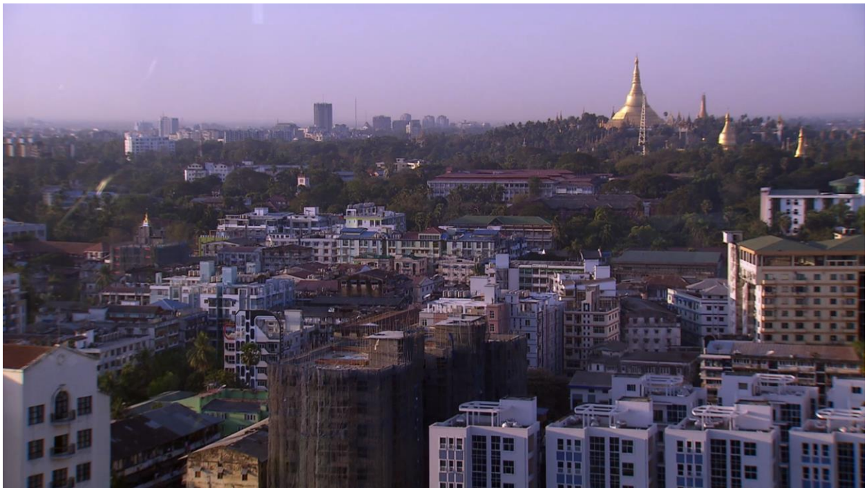
Myanmar, where our story unfolds